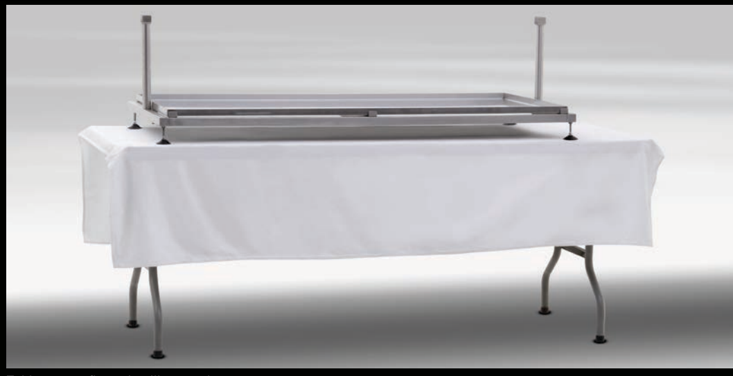
Table top configuration Illustrated