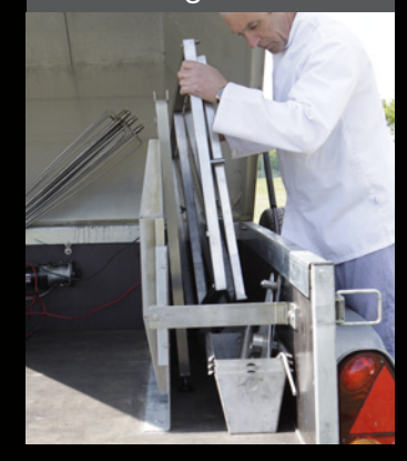
Carving tray storage